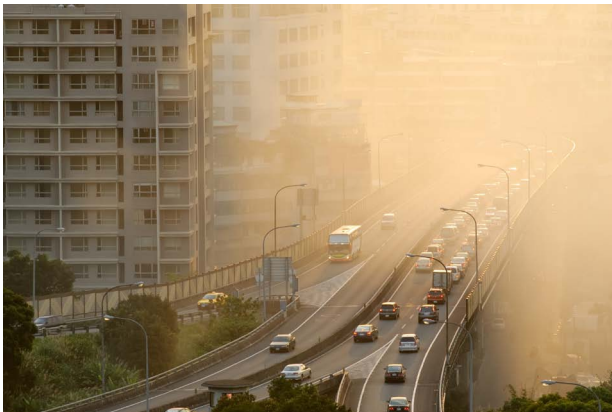
The PWD52 is well suited for meteorological and environmental observation networks.